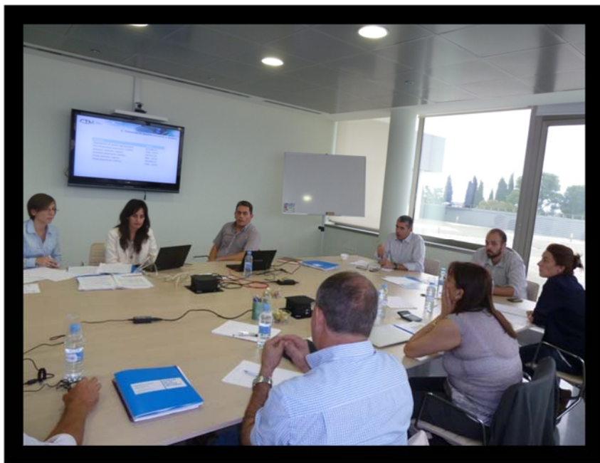
Image 8. Kick Off Meeting 5