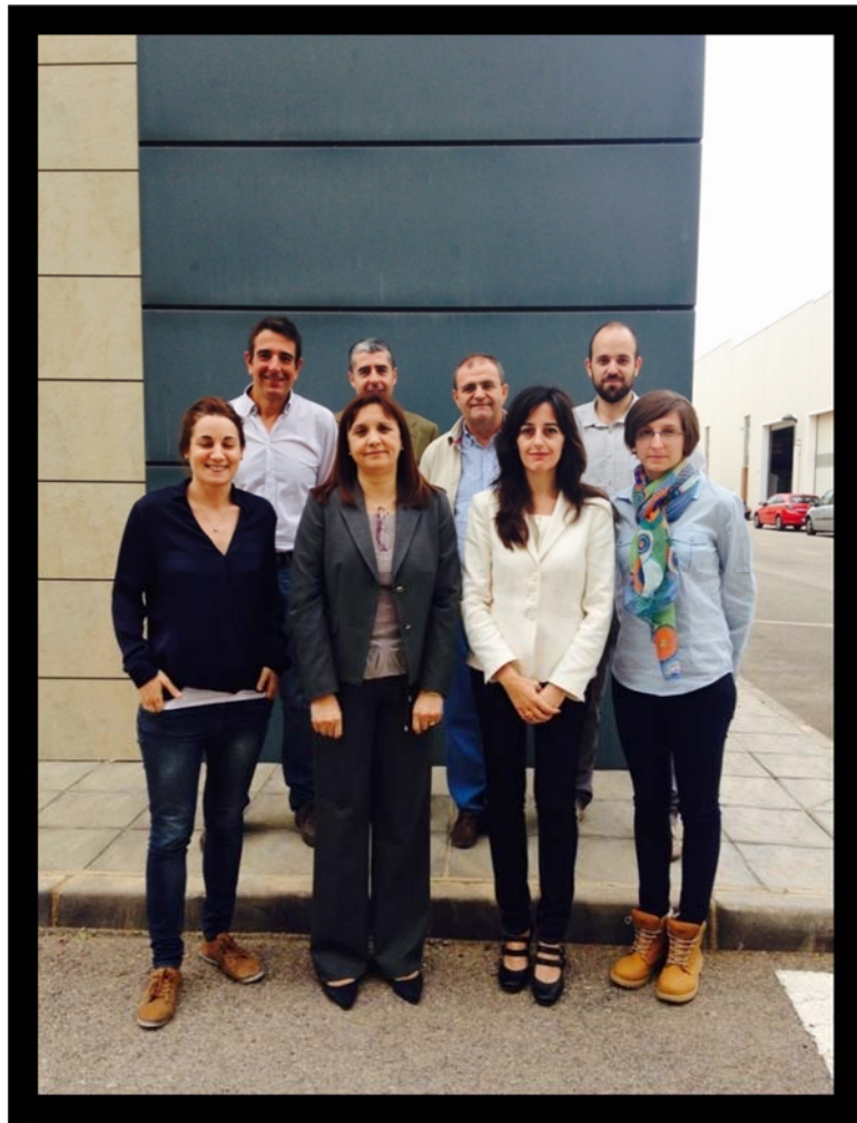
Image 7. Kick Off Meeting 4