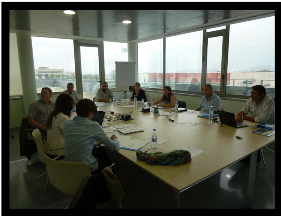
Image 5. Kick Off Meeting 2