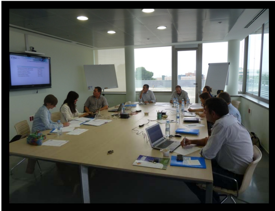
Image 6. Kick Off Meeting 3