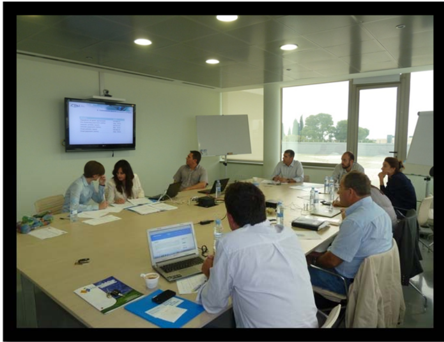
Image 4. Kick Off Meeting 1