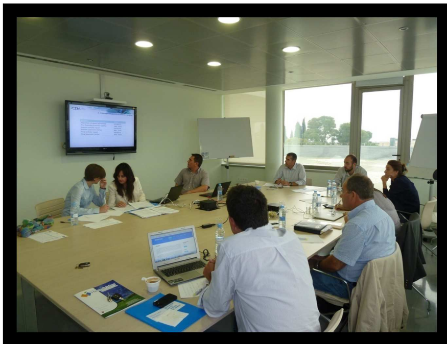
Image 4. Kick Off Meeting 1