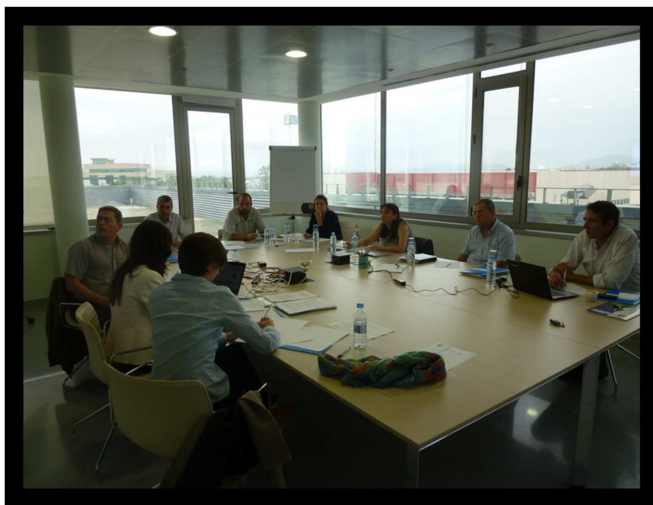
Image 5. Kick Off Meeting 2