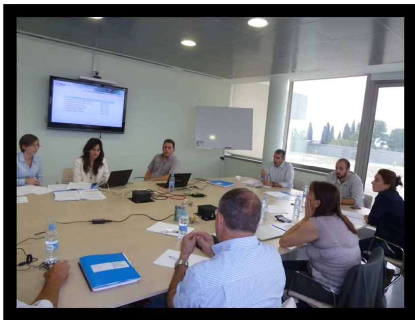
Image 8. Kick Off Meeting 5