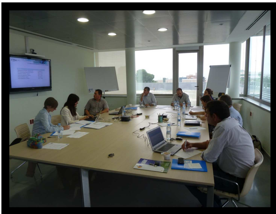
Image 6. Kick Off Meeting 3