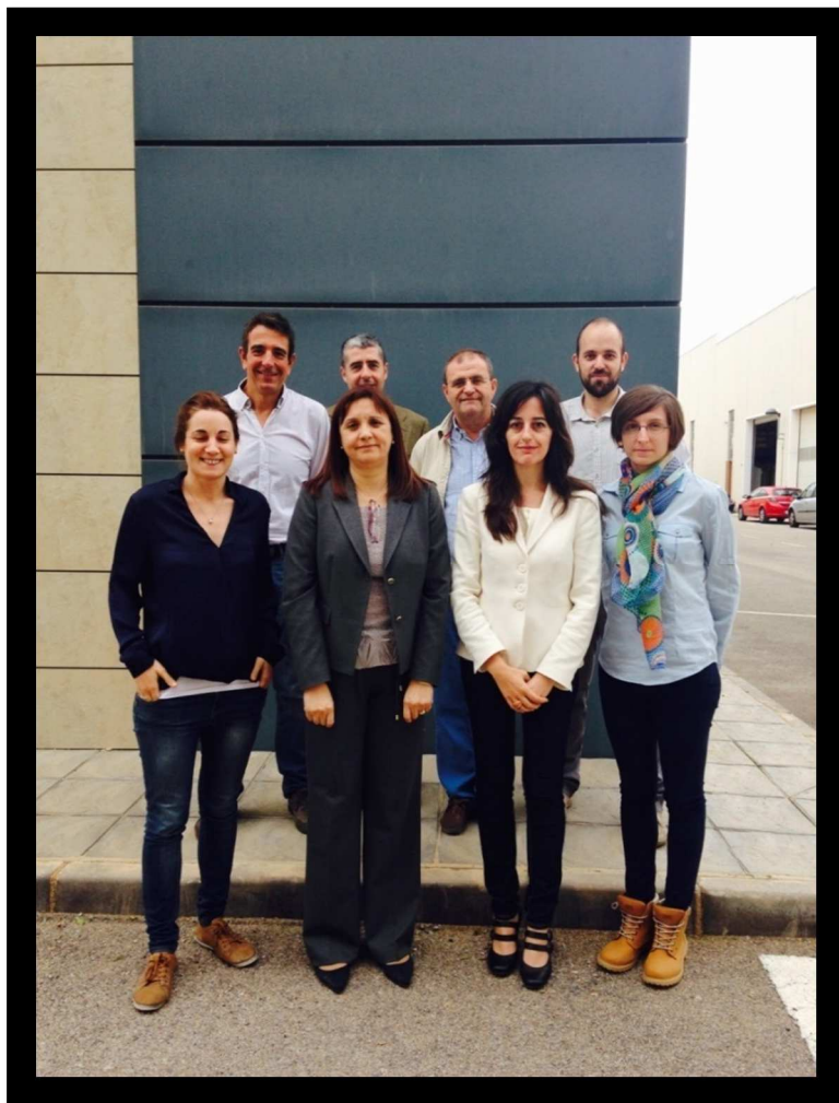
Image 7. Kick Off Meeting 4