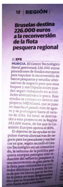
Figure 2 Article of the MEDGuard Project in “La Verdad” newspaper.

November, 23, 2015. Page. 12. Región. Brussels allocates 226,000 euros to the restructuring of the regional fishing fleet.