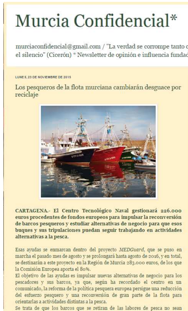
Figure 5 Article of the MEDGuard Project in “El Cofidencial de Murcia” digital newspaper.