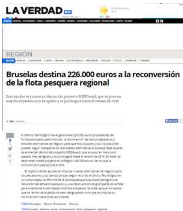
Figure 3 Article of the MEDGuard Project in “La Verdad” digital newspaper.