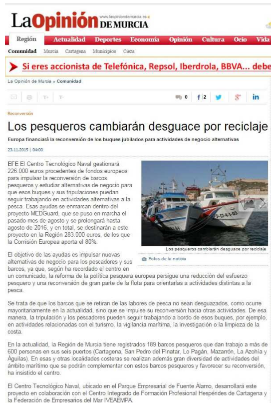
Figure 4 Article of the MEDGuard Project in “La Opinión de Murcia” digital newspaper.